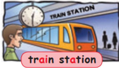
Train station : محطة القطار